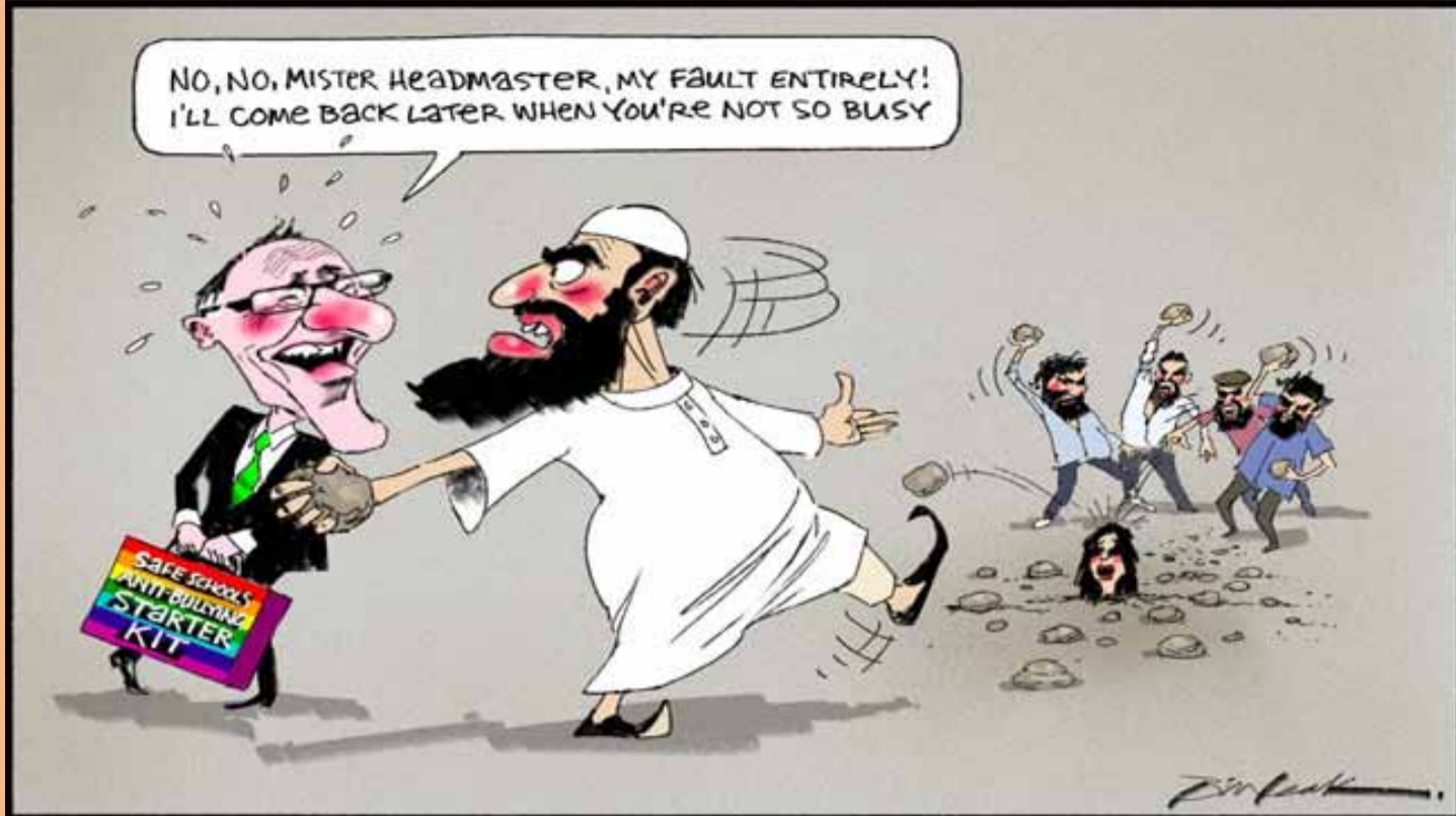
Bill Leak The Australian 19 May 2016

The leader of the Australian Greens party tries to sell the Greens gender education policy at an Islamic sharia law enforcement event.