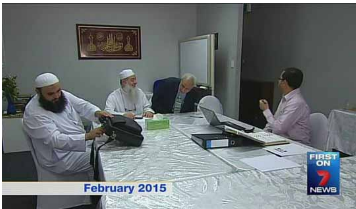
Channel 7 News: Sharia court Fairfield New South Wales

In 2011 the Federal Government rejected the submission for sharia law by the Australian Federation of Islamic Councils (AFIC) to its multiculturalism inquiry. But the door had been opened for separate Islamic laws; and the divisive pol-