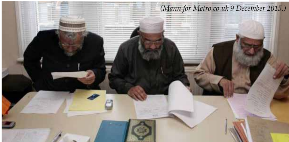
A British sharia court in operation.

The following few headlines suggest that sharia law exists in Australia, and that behaviour which is outside Australian law is being overlooked.