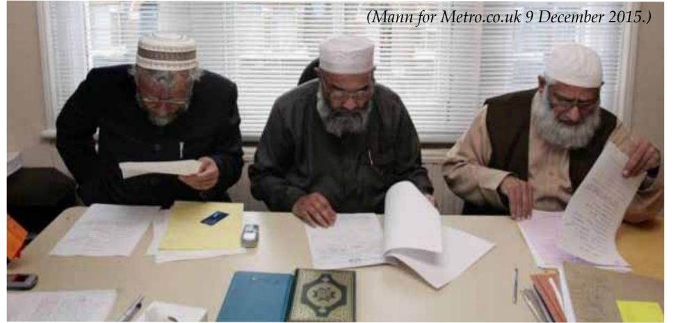
A British sharia court in operation.

The following few headlines suggest that sharia law exists in Australia, and that behaviour which is outside Australian law is being overlooked.